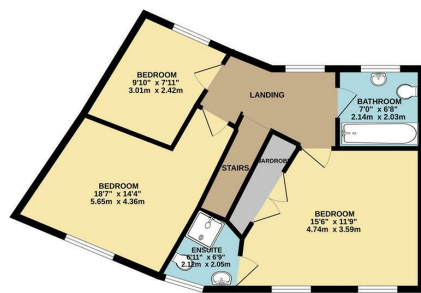
TOTAL FLOOR AREA: 1127 sq.ft. (104.7 sq.m.) approx. Whilst every attempt has been made to ensure the accuracy of the floorplan contained here, measurements of doors, windows, rooms and any other items are approximate and no responsibility is taken for any error, omission or misstatement. This plan is for illustrative purposes only and should be used as such by any prospective purchaser. The services, systems and appliances shown have not been tested and no guarantee as to their operability or efficiency can be given. Made with Netplan (2020)